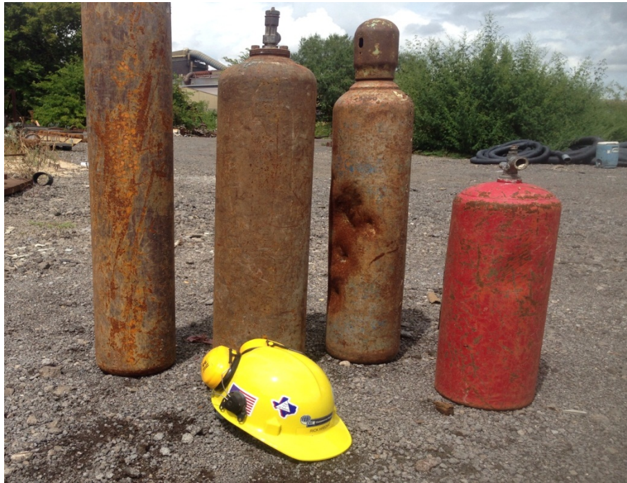
COMPRESSED GAS CYLINDERS