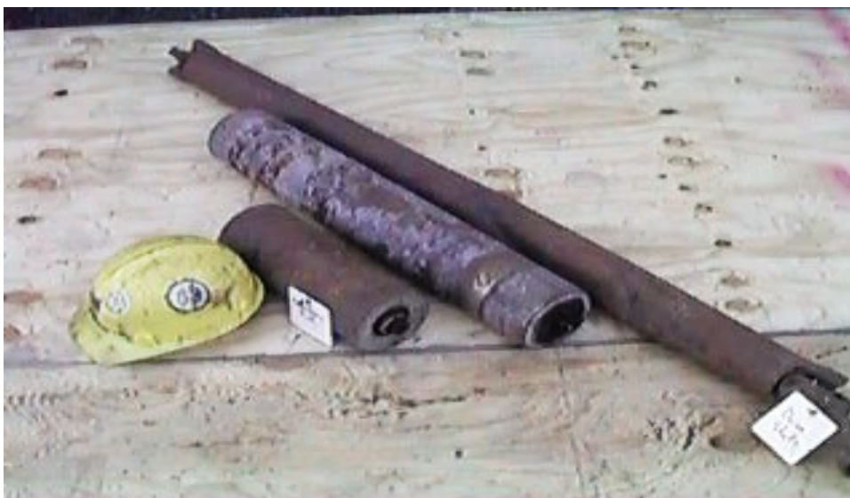
AUTO / TRUCK DRIVE SHAFTS & CONVEYOR ROLLERS