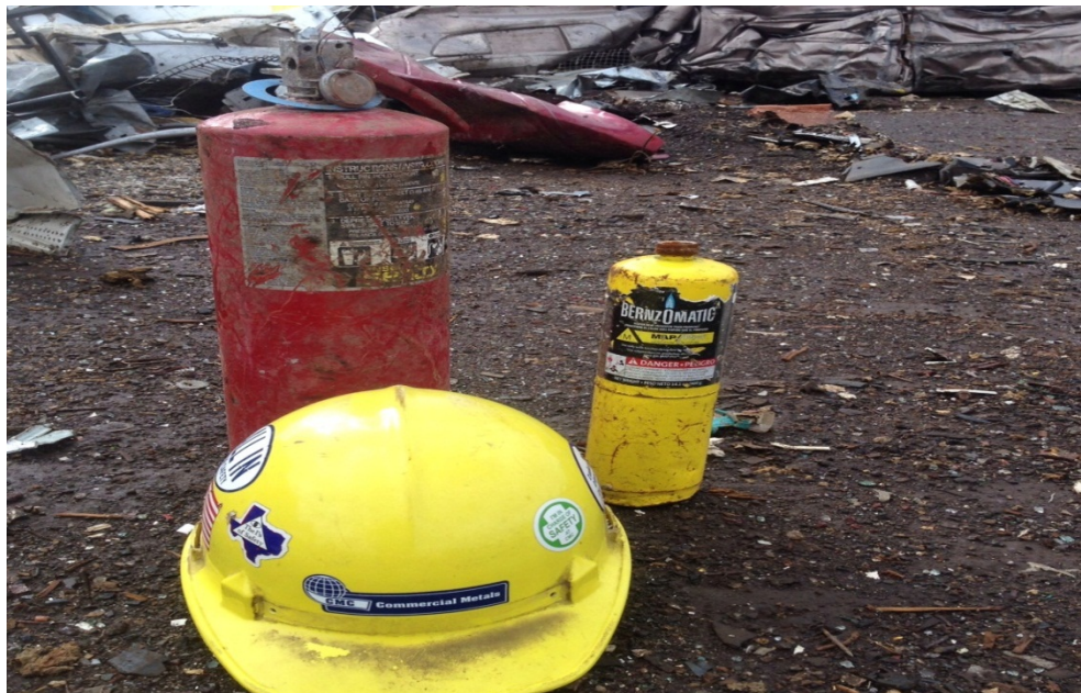
SMALL COMPRESSED GAS CYLINDERS FIRE EXTINGUISHERS