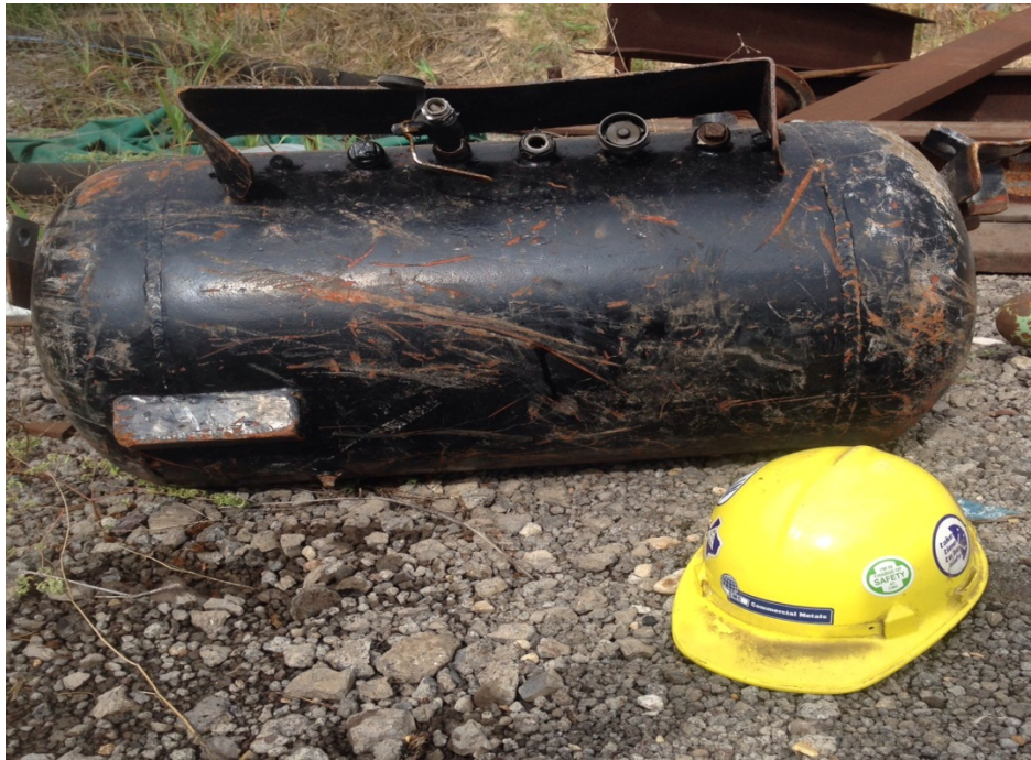
AIR COMPRESSOR TANK FUEL TANK