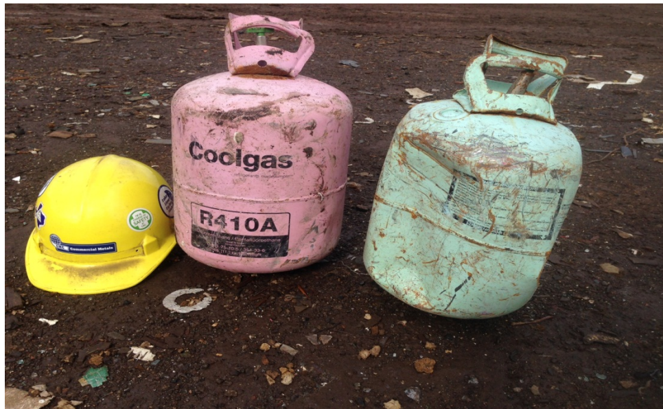
ACETYLENE / PROPANE CYLINDER FREON CANISTER